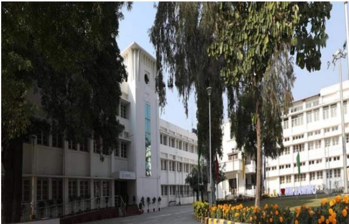
IIM Jammu will open a off-campus at University of Ladakh, signs agreement

Education | Press Trust of India | Updated: Dec 19, 2022 8:07 am IST | Source: PTI