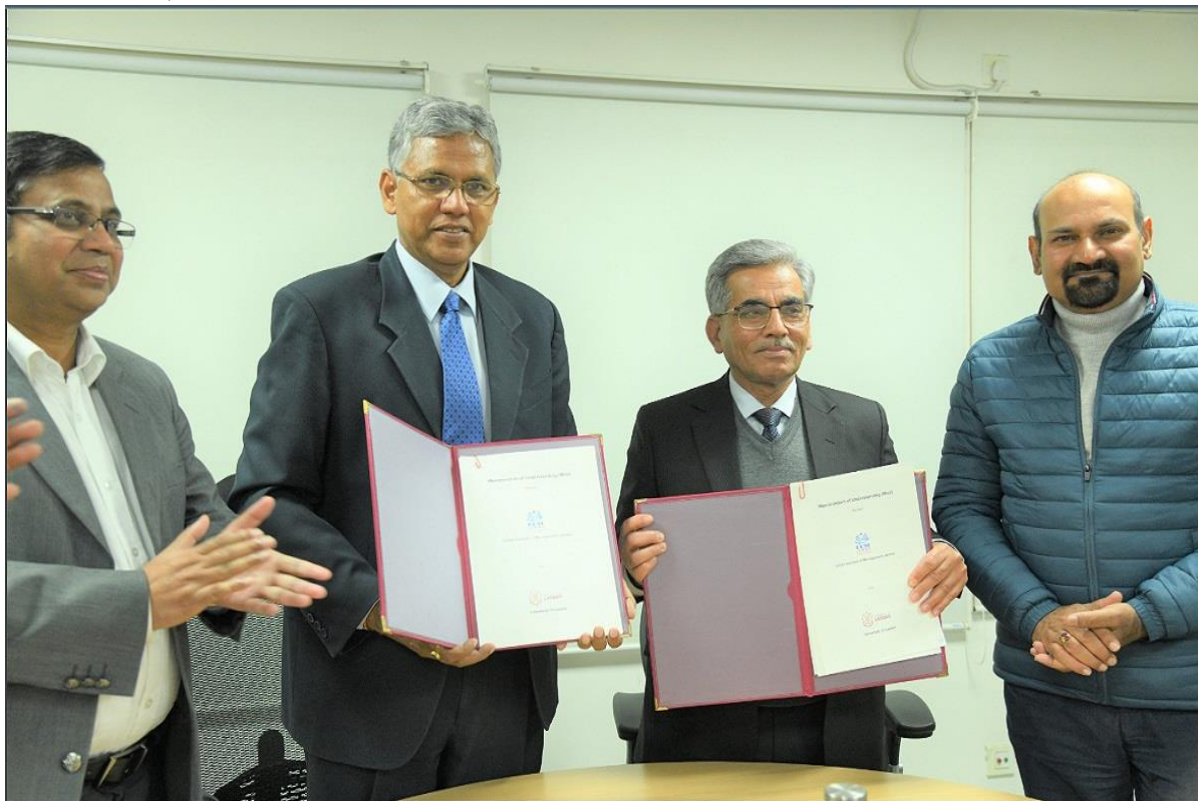
IIM Jammu-University of Ladakh MoU

IIM Jammu-University of Ladakh MoU: The Indian Institute of Management-Jammu (IIM-Jammu) has signed an agreement with the University of Ladakh on Sunday, December 18, 2022, to work on areas such as academic cooperation, joint research, and faculty exchange.