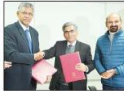
University of Ladakh Vice-Chancellor & Director IIM Jammu shaking hand after signing an MoU on Sunday.

organizing joint conferences, short-term education programmes, research, boot camps and various other areas, he said, adding that the collaboration between both Institutes will lead to meaningful outcome in the interest of the stakeholders and