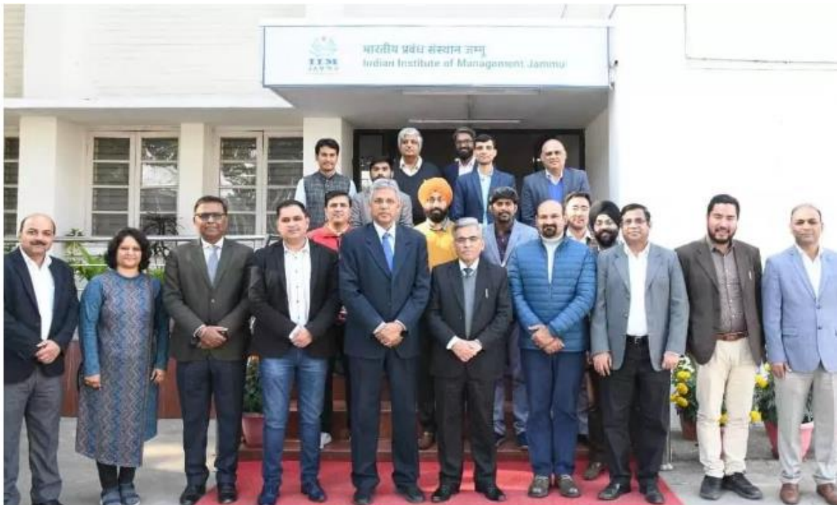
IIM Jammu opens transit off-Campus in Leh-Ladakh at the University of Ladakh with signing of the MoU